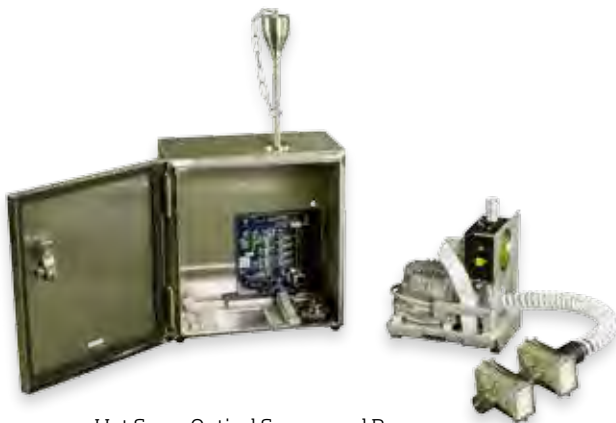
Hot Swap Optical Sensor and Pump