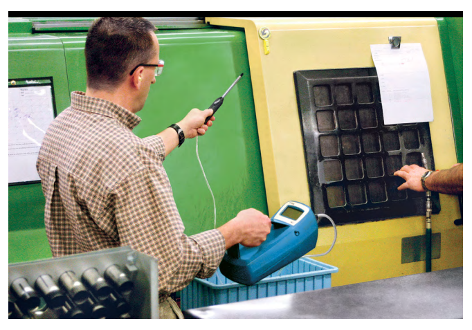
P-Trak Ultrafine Particle Counter and accessories includes: Telescoping Sample Probe, Shoulder Strap, Inlet Screen, Spare Wicks (2), Alkaline Batteries, Alcohol Fill Capsule with Storage Cap, Reagent Grade Isopropyl Alcohol, Zero Filters (2), Carrying Case, TrakPro® Software, Computer Cable, Operation and Service Manual, Calibration Certificate, and Two-year Warranty.

PC with Microsoft Windows® 2000 or XP; Windows-compatible printer; 5 MB hard disk space; and available RS232 serial port (for downloading)