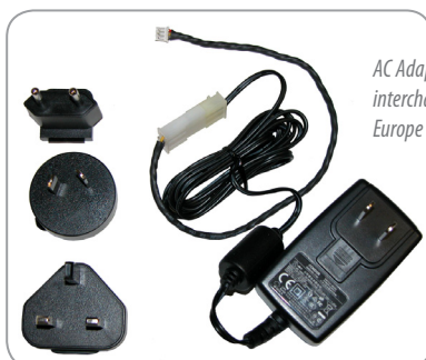
AC Adaptor Kit 14-21243 includes interchangeable US, UK, Continental Europe and China electrical connectors.

1. Tested in accordance with ANSI/ESD STM3.1-2006.