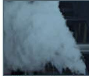
Wide Fog Curtain

The AP35, Cleanroom Ultrapure Fogger produces a high volume of ultrapure fog needed for 3D video and visual airflow confirmation in clean rooms, sterile rooms, ISO suites and medical rooms. The AP35 provides about 5 cubic meters of ultrapure fog per minute with 533 ml / minute fog density for up to 75 minutes to visualize airflow for 20 to 30 feet; surpassing all other ultrapure foggers with 2X more fog volume, 2X more fog density and 2X more visual airflow distance - for about the same cost as other ultrapure foggers.