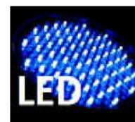
Blue LED Illuminator Remote Control