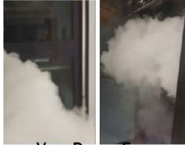
Very Dense Fog